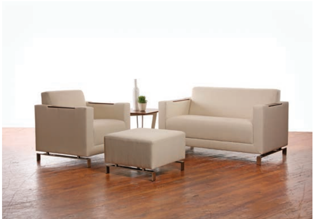
left to right 402L-WM, 402O-24-M, 402ET-22S-V, 402LS-WM