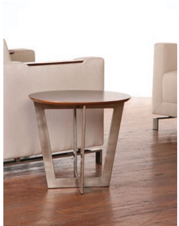
front to back 402ET-22R-V, 402L-WM