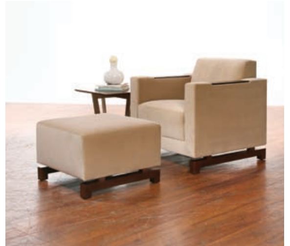
left to right 402O-24-W, 402ET-22S-V, 402L-WW