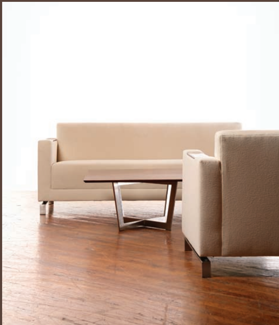
left to right 402S-WM, 402CT-36S-V, 402L-WM