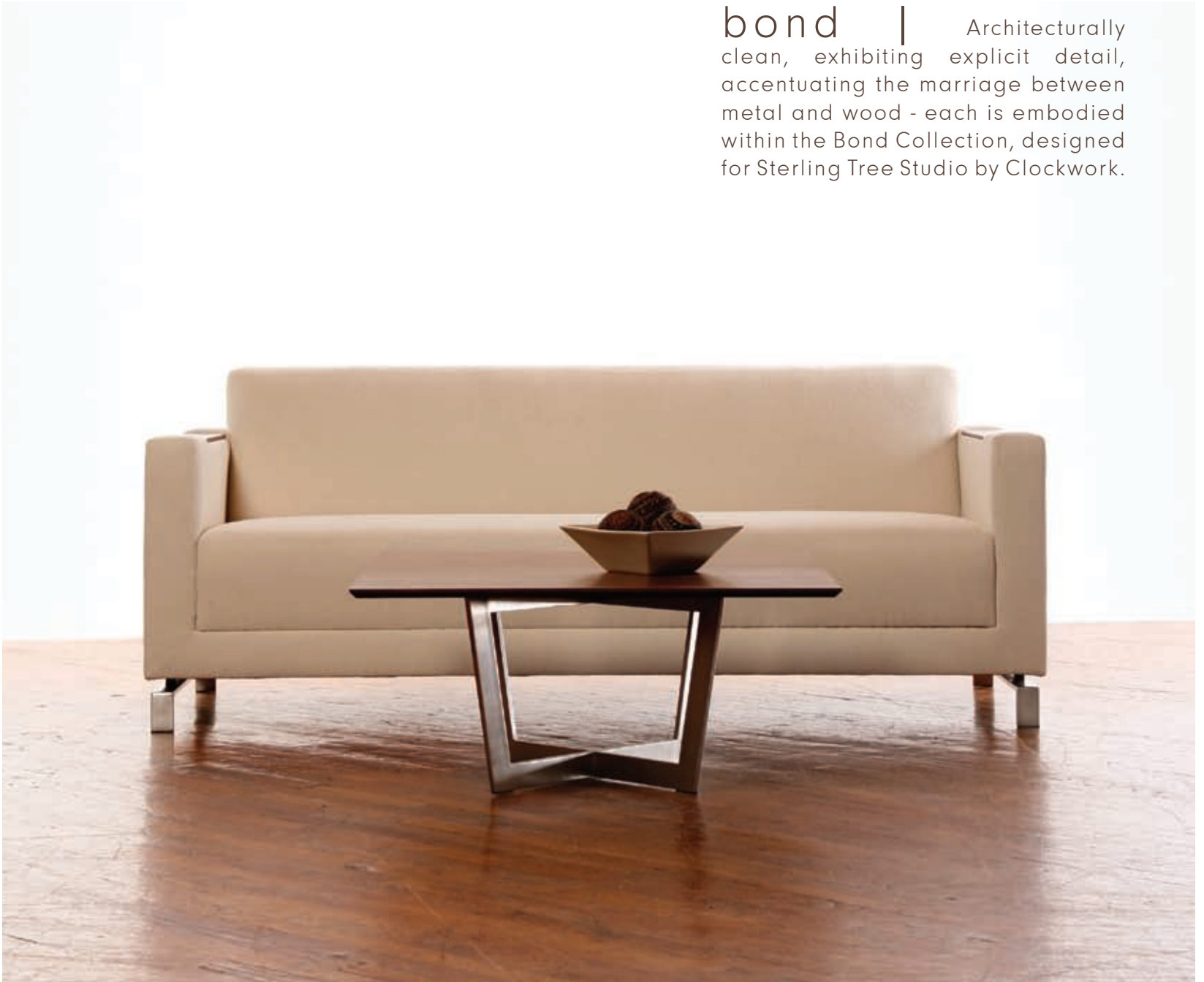
front to back 402CT-36S-V, 402S-WM

bond | Architecturally clean, exhibiting explicit detail, accentuating the marriage between metal and wood - each is embodied within the Bond Collection, designed for Sterling Tree Studio by Clockwork.