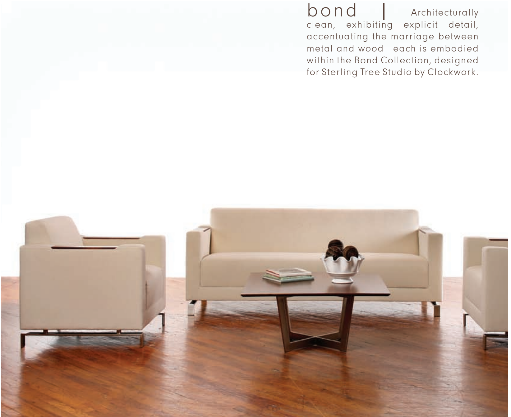
left to right 402L-WM, 402S-WM, 402CT-36S-V, 402L-WM

bond | Architecturally clean, exhibiting explicit detail, accentuating the marriage between metal and wood - each is embodied within the Bond Collection, designed for Sterling Tree Studio by Clockwork.