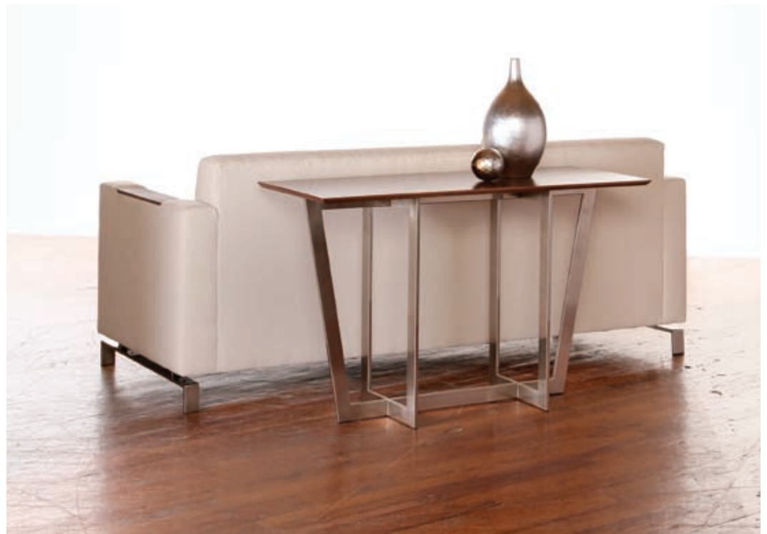
front to back 402ST-48-V, 402S-WM