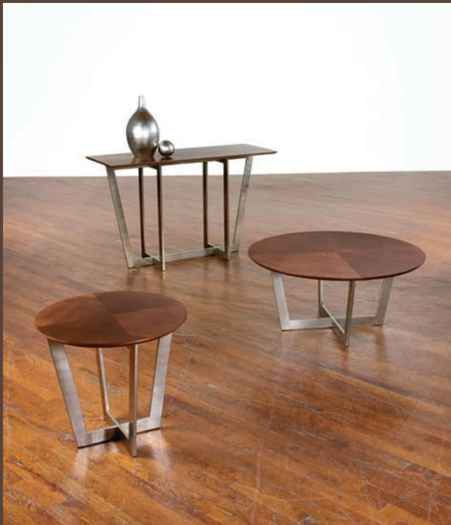
left to right 402ET-22R-V, 402ST-48-V, 402CT-36R-V